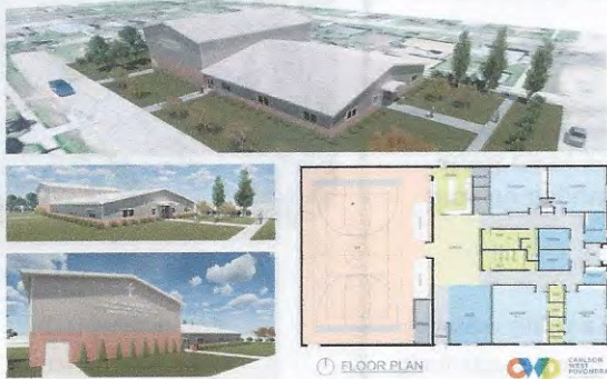
OUR REDEEMER LUTHERAN CHURCH AND SCHOOL MINISTRY CENTER